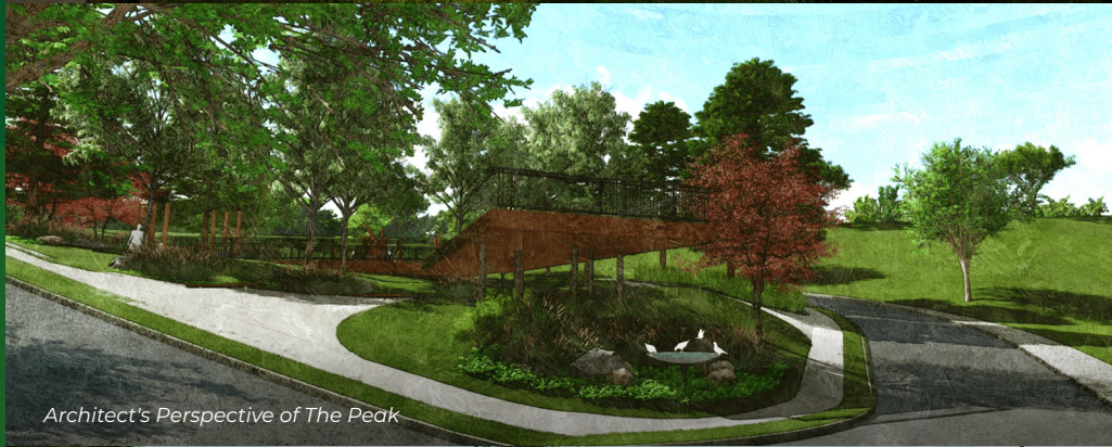
Architect's Perspective of The Peak