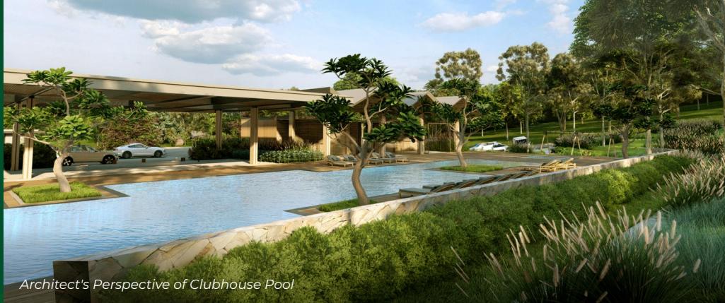
Architect's Perspective of Clubhouse Pool