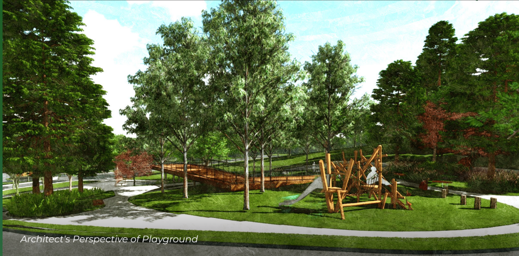
Architect's Perspective of Playground